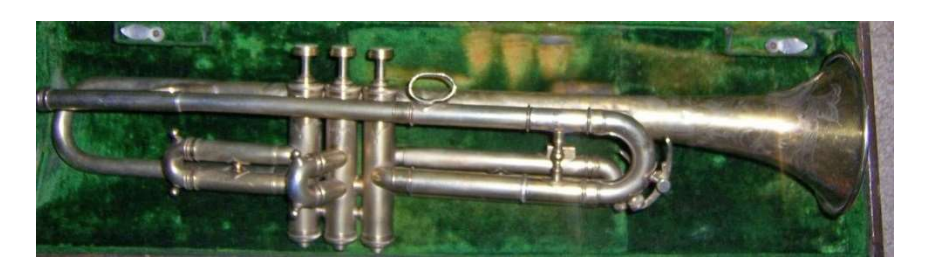
#10264x c.1931 (below & 3rd at right)