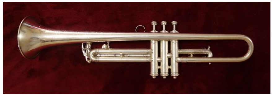
#11005x c.1935 (below & mouthpieces at right)