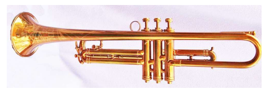
#11318x c. 1935 (the last one I have recorded)