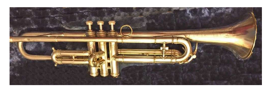
In 1934 Martin said, "Note particularly the body design of the Troubadour, long, narrow, smart. Has fine intonation, brilliant voice, balance, and unrestrained volume. Built of French yellow brass; medium bore only; hand tempered. The Troubadour is a particular favorite among the younger dance men."