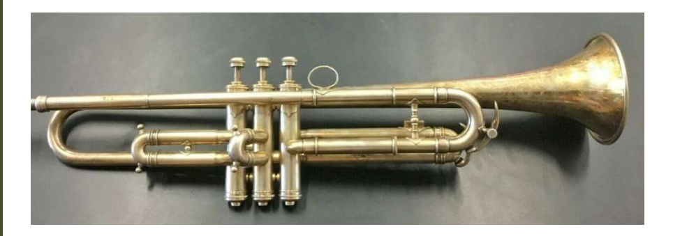
Troubadour #9982x c.1930 (two below & right)