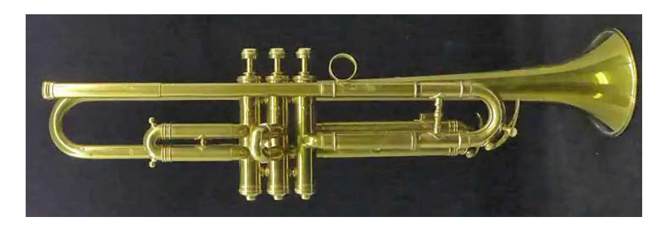
#10226x c.1931 (below & 2nd at right)